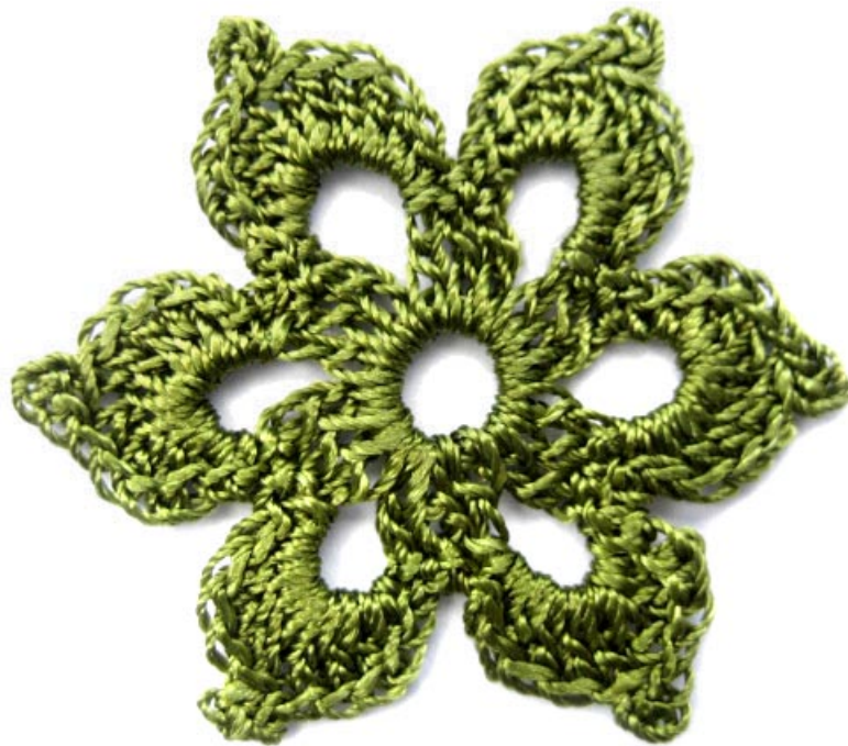
Quilt motives as a lace pattern