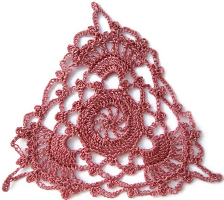
Quilt motives as a lace pattern