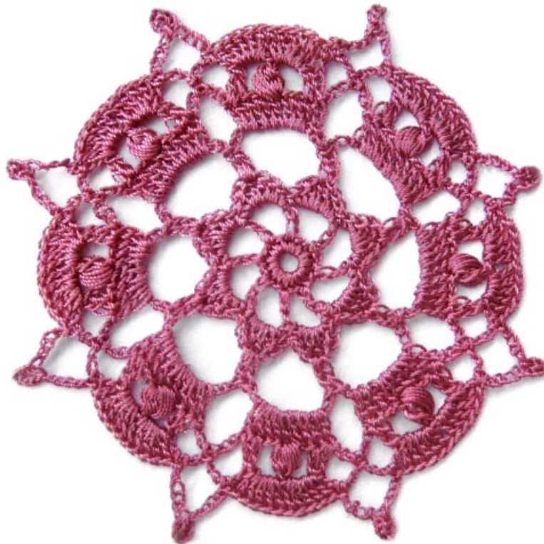
Quilt motives as a lace pattern