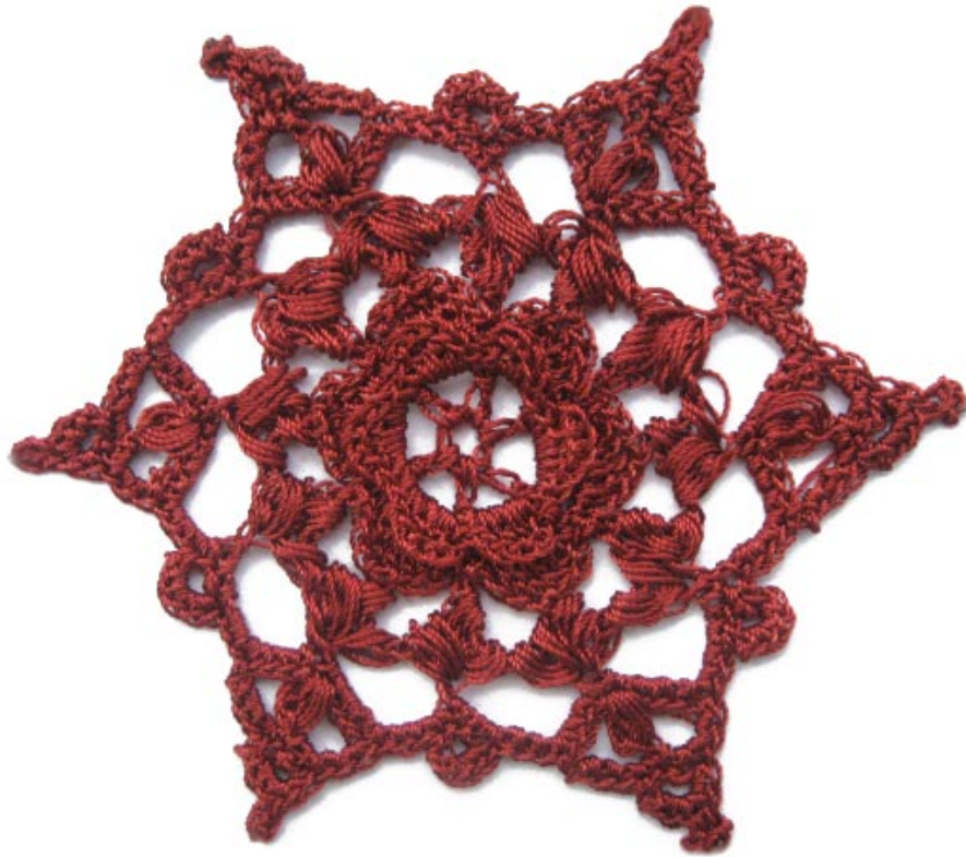
Quilt motives as a lace pattern