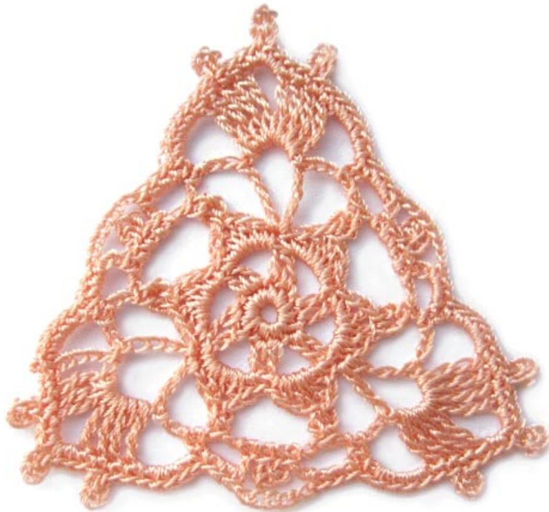
Quilt motives as a lace pattern