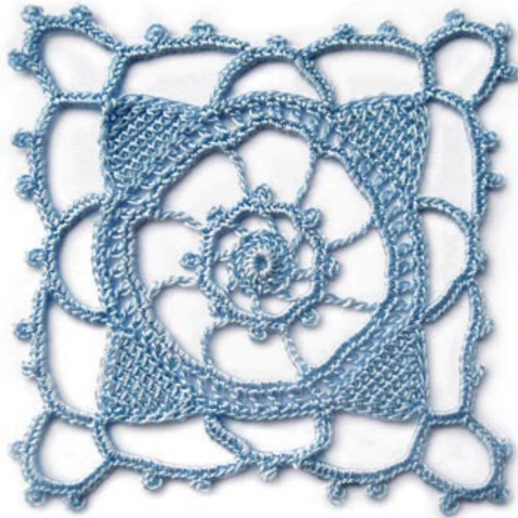
Quilt motives as a lace pattern